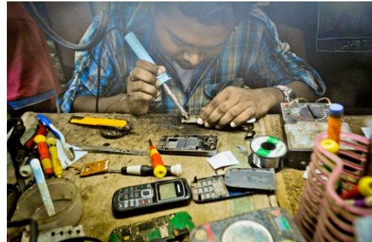
Figure 1: An expert repairer is practicing at his desk in Gulistan Underground Market

very sound attention. I tried to get eyes closer to the IC so that I could see it better, but it was not possible because of the hot air gun blowing hot air. My hand was trembling, and I was struggling to grip the chip with my forceps. But after a number of failed attempts, finally I succeeded ...”