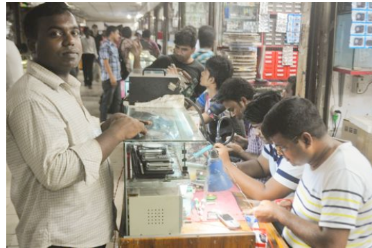
Figure 3: Repairers at Gulistan Underground Market.

like this to an old friend. You have to value people in order to value your business.”