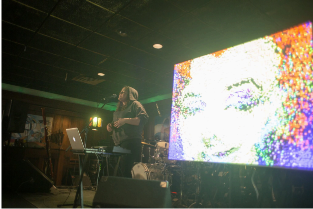
Figure 5. The subsequent performance of Intermodulation I

Because 'Breaking AndyWall' was originally designed to interact with the audience' hammer smashing, it started producing a lot of unexpected graphical glitches when I first converted it to interacting with live sound. But somehow I thought it could be quite cool if I used that error to visual effect.