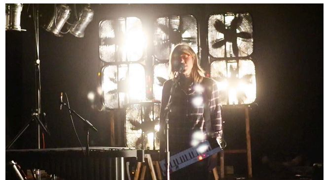
Figure 3. Intermodulation II, 11/10/2016