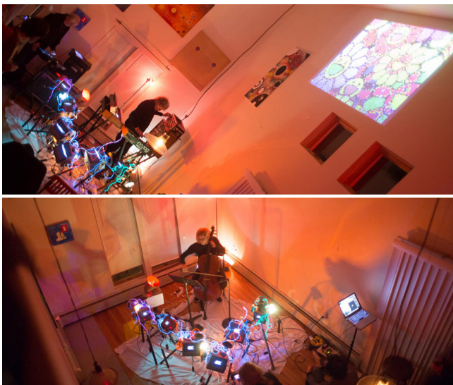
Figure 2. Intermodulation I, 12/18/2015

The first Intermodulation began in November 2015 and eventually produced two audio-visual performances in late 2015 and early 2016. These performances involved two groups of musicians: ‘The Electric Golem’ [64], a New York-based improvisational electronic music duo that releases and performs their music in international venues; and cellist Min Park, a classical musician with diverse experience in both solo and orchestral performance.