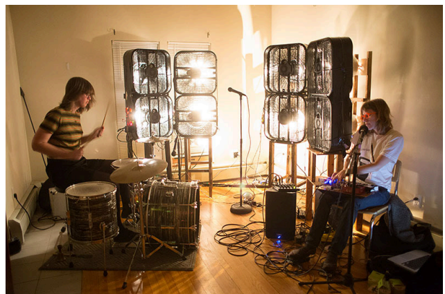
Figure 6. A subsequent performance of Intermodulation II

The whole idea was that if you just stop and listen that listening will be your guide... The qualities that you want in a good improvisation are also the qualities that you want to develop in yourself and in your relationships with other people. There's a feeling there that you want friends who are good listeners and can respond. You want to be a good listener. It connects more largely to just being a human in the world